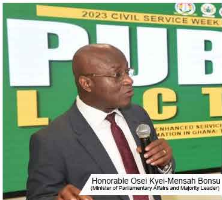
Honorable Osei Kyei-Mensah Bonsu (Minister of Parliamentary Affairs and Majority Leader)

The Majority Leader of the Parliament of Ghana and the Minister for Parliamentary Affairs, Honorable Osei Kyei-Mensah Bonsu on Monday, 29th May 2023 at the Nathan Quao Auditorium, CLOGSAG urged the leadership of the Civil Service to take immediate steps to address pressing bottlenecks in order to enhance service delivery in the Civil service.